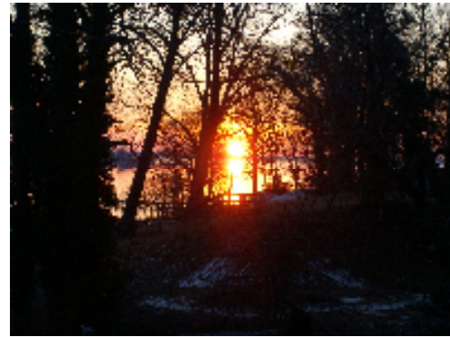
Sunrise on Aquia Creek