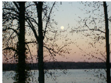
Full Moon on Aquia Creek