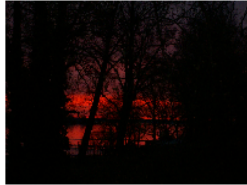
Sunrise on Aquia Creek