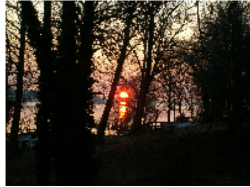
Sunrise on Aquia Creek