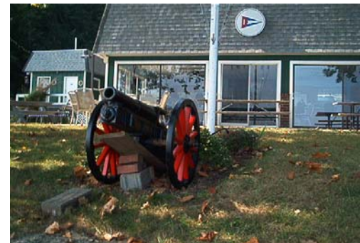
Landmark Yacht Club.....calling you!