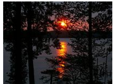
TRANQUILITY AND PEACE AS THE SUN RISES ON AQUIA CREEK.....