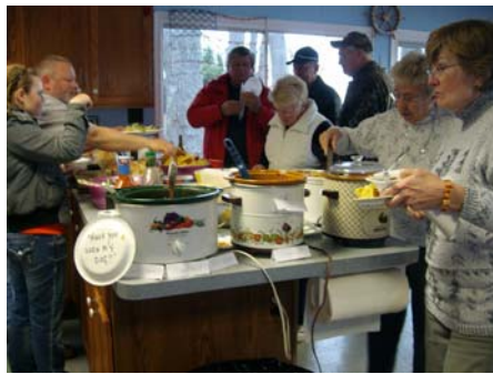
Dig In!!!! Chili for everyone!!!!!!