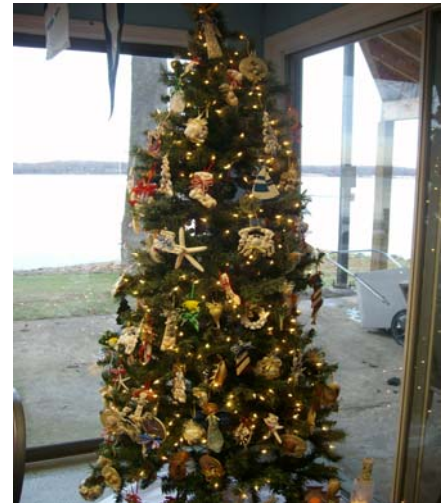
Beautiful Decorations!!! handcrafted by Peggy Myruski

No boating happening at this moment – Happy Thanksgiving!!!!!!!!!!