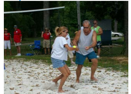
“GO TEAM GO!!!!”